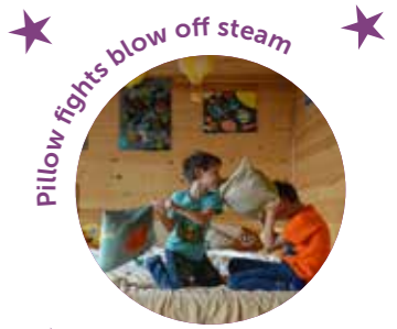
Pillow fights blow off steam