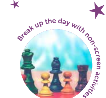
Break up the day with non-screen activities